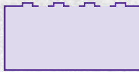
MEETING ROOM COMBINED

Main Floor 90ft x 90ft Stage 40ft x 90ft Capacity Banquet..... 350 Reception..... 750 Classroom..... 400 Theater..... 1000 $1,500 Full Day